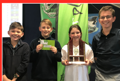
Young Einstein Quiz Year 7/8 Champions