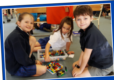
Year 3/4 Lego Masters Inter-House Challenge

Warehouse Stationery has a programme called Support Your School, which gives money back to schools each time you shop there. Just nominate Winton School at the till and 5% from every purchase you make goes toward the school.