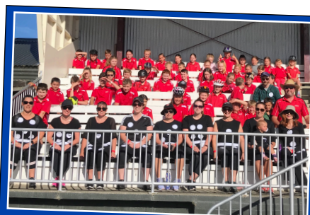
Winton Fun Run