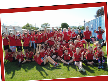
Secondary Triathlon Champs